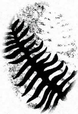
‘A‘ala kupukupu o Kanehoa